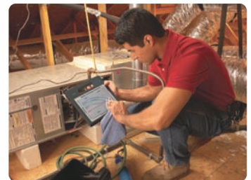
Easily clean the rugged F5 while working in harsh environments.

The Motion F5v comes standard with Gorilla™ glass , offering up to four times the strength in breakage resistance 3 , perfect for real-world mobile work environments. Add 180-degree viewing angles , Hydis AFFS+ LED backlit display and View Anywhere® technology for reduced reflectance and glare and you get the best tablet PC viewing experience available for outdoor use. Improved battery life over typical displays and an extremely damage-resistant surface make the Motion F5v tough enough to withstand your work environment and powerful enough to get the job done.