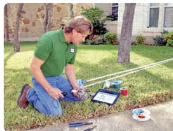
Take the F5 with you no matter where your work takes you.

Don't worry. The F5v brought its hard hat. Tested and proven to withstand field-ready conditions such as dust, heat and rain, the Motion F5v is ready to work wherever you're working. The strong internal magnesium frame, shock mounted display and hard disk drive (HDD) or optional solid state drive (SSD) protect against drops and bumps. Fully-sealed, the F5v is protected against the elements and easily cleaned.